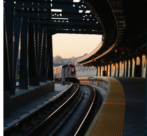
Communications Based Train Control (CBTC). Within ten years, these benefits will cover a total of eleven additional lines, benefiting five million daily riders. The work will also require the refurbishment, replacement, or upgrading of myriad supporting

State-of-the-art infrastructure for optimum reliability, performance, and safety. Within five years, the latest computerized signal and track infrastructure will be installed on five additional lines, so three million daily riders are on lines with